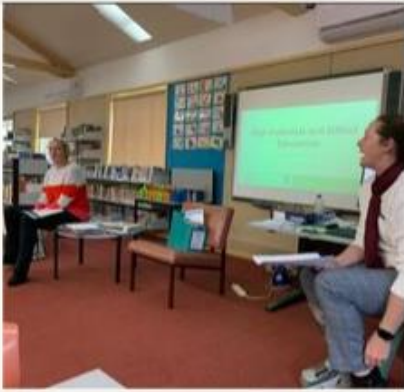
Professional Learning for all staff on the High Potential and Gifted Education policy changes