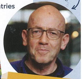
author and Children's Laureate