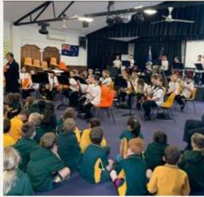
Introduction to the Training Band' for Year 2 and 3 students