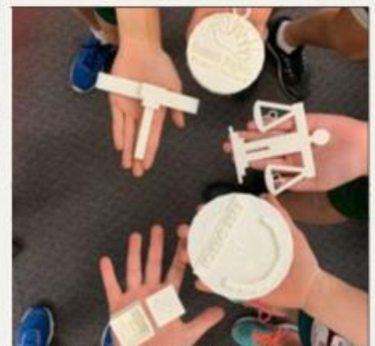
What is the benefit of a 3D Printer at school? Year 6 explained how their learning was broadened through design and printing.

How does your LEARNING connect to previous KNOWLEDGE?