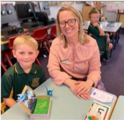
Students in 1E were excited to share their palaeontology notes with me.