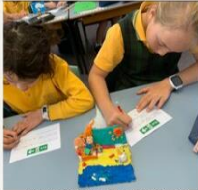
Students in 3E invited me to share their learning linked to their quality text, Storm Boy